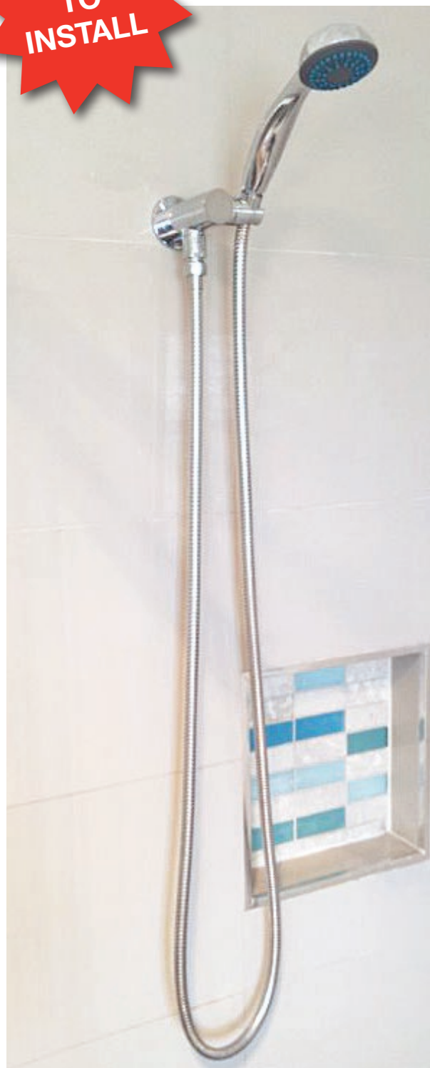
LS4 Handheld Shower Kit pictured above